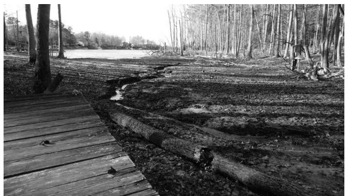
East cove on Beechcreek Road. Photograph following heavy rainfall in late December of the same area, taken one month later. The lake was at 353.5 ft. msl when photographed. Scouring has obviously been confined primarily to the narrow inflow stream. The bulk of the sediment field remains the same as before anticipated scouring.