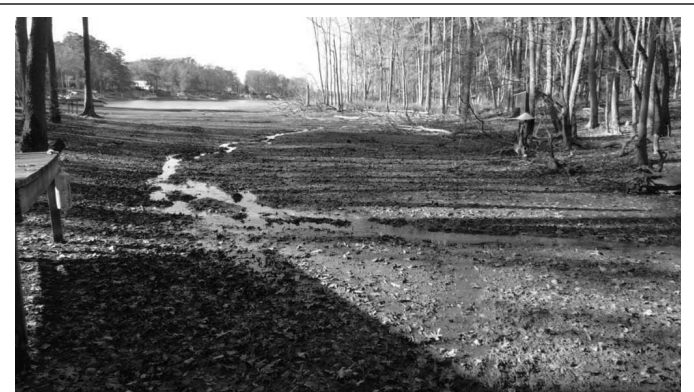
East cove on Beechcreek Road. Photograph taken December 1st when lake level was at 350 ft. msl. See the large amount of sediment that has accumulated over about 7 years of high lake levels.

During the Saluda Hydro Relicensing process, extensive meetings and discussions were held by SCE&G with interested stakeholders, including Lake Murray Association (LMA) on how the lake would be operated to meet certain operational objectives. Many topics were discussed including the shore line management plan, water