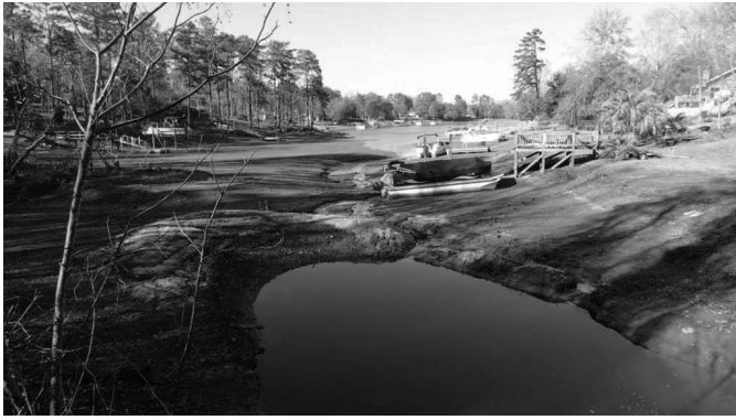
West cove off Beechcreek Road. Photograph taken December 1st when lake level was at 350 ft. msl. Notice the large banks of sediment deposits to the left of the inflow stream.