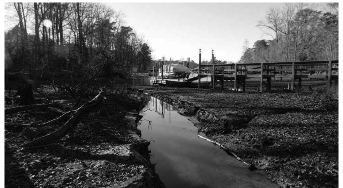
Middle cove on Beechcreek Road, a different view than the previous photograph. This view of the inflow stream was taken the first week in January after scouring. Scouring is mostly confined to the width of the stream, and large deposits of sediment to the right and left of the stream remain.