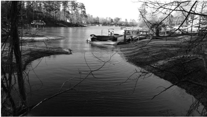
West cove off Beechcreek Road. Photograph of the same area as above, taken the first week in January when lake level was at 353.5 ft. msl. Notice the large fields of sediment deposits to the left of the inflow stream remain and are unchanged.