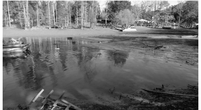
Middle cove on Beechcreek Road. Photograph taken December 1st when the lake level was at 350 ft. msl. Observe the area of silt and sediment that has been deposited in the mouth of this cove.

quality, lake levels and water releases to benefit the spawning of fish in the lower Saluda and Congaree Rivers below the dam. Two important goals discussed were maintaining lake levels during summer months as near normal operating pool (358 ft. msl) as possible, and to retain high water quality in the lake. LMA strongly supports both of these goals. During the summer months, our association collects water samples from various locations in the lake. The samples are analyzed for fecal coliform and total phosphorous by SCE&G. Generally, our samples show that water quality in Lake Murray is very good and meets acceptable fresh water standards for these two contaminants.